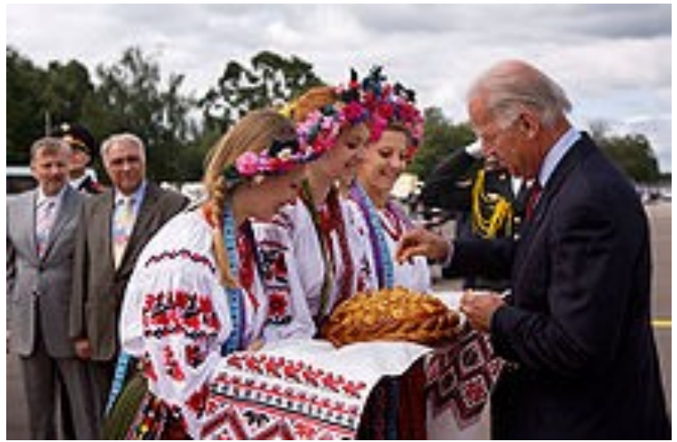
American Vice President Joe Biden dips a piece of bread in salt as part of a welcoming ceremony upon his arrival in Kiev, Ukraine, July 20, 2009.

Leading on from this, we will think about how different communities and cultures may welcome people and children will be encouraged to compare and contrast a variety of cultural traditions linked to welcoming new members of the community. We will explore different cultural foods and children will be invited to bring in and share a food dish linked to their home